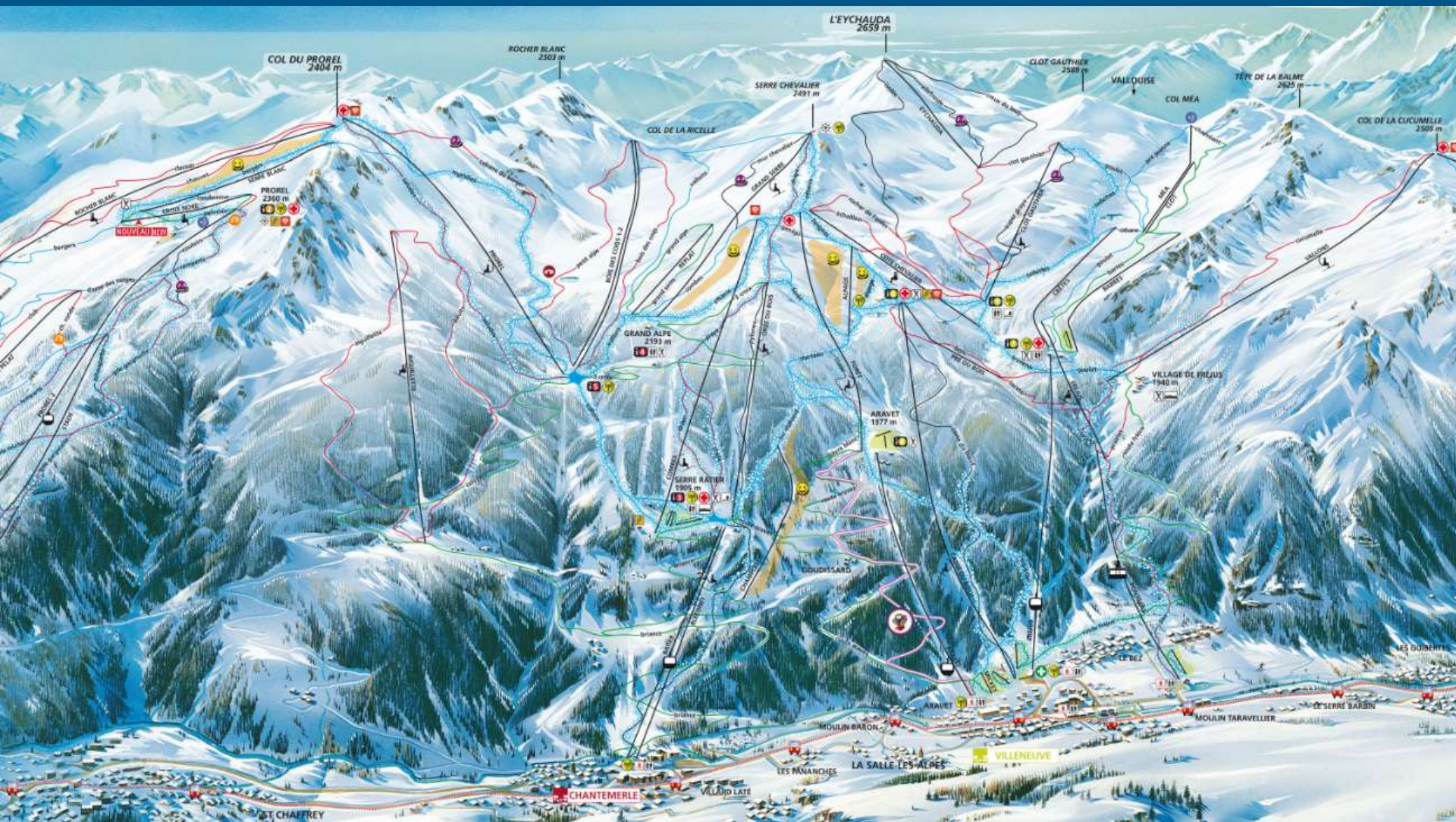
Full map available from http://www.serre-chevalier.com/en/winter/ski-area/piste-map/ Club Med ski pass offers access to GRAND SERRE CHEVALIER ski area